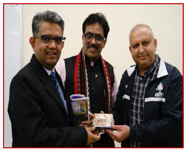
International Student of GSI (Global